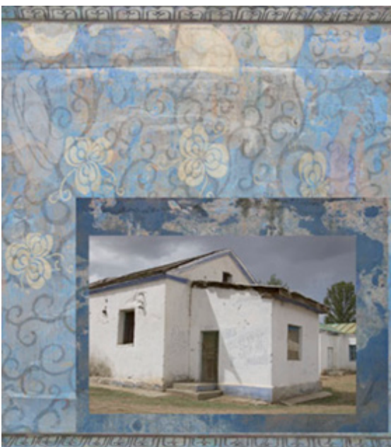
Lyn Bishop, Private (Berlin, Germany) 2007