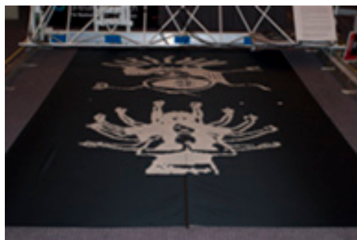
CAFA Team in the Photo Studio, August 2004